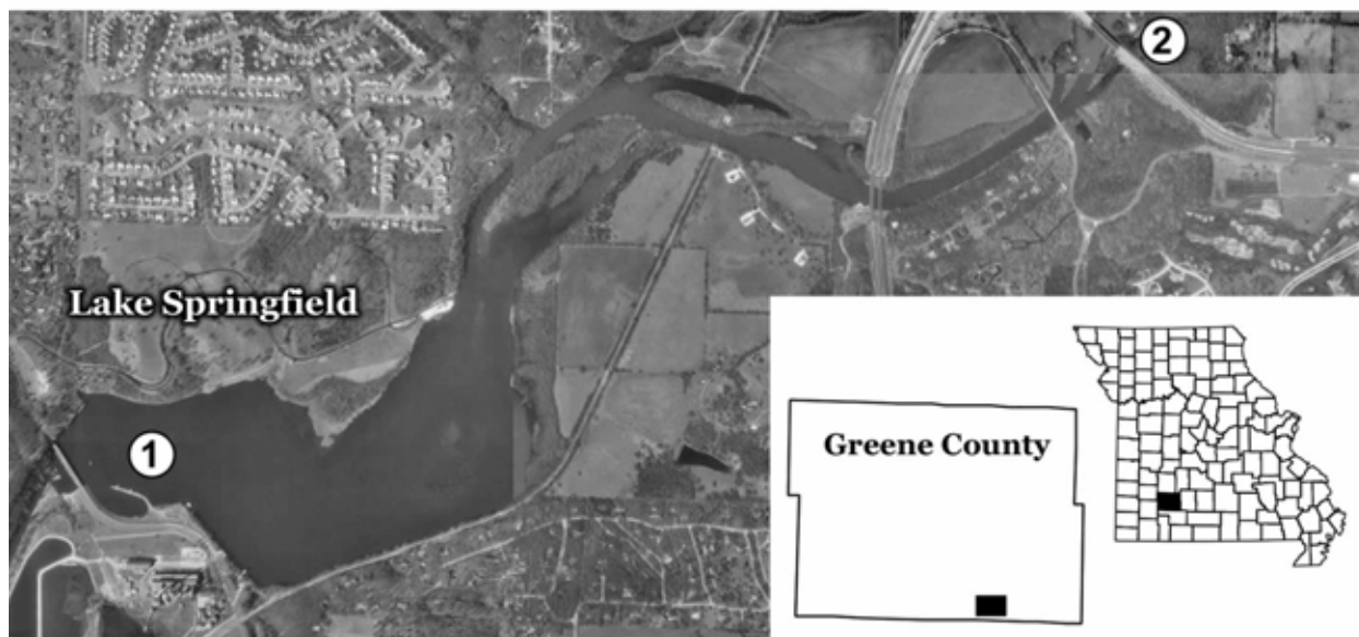
Figure 63. Location of Lake Springfield and its sample sites.

Lake Springfield is used as a source of cooling water for the James River Power Plant. This 206 acre lake has a 165,000 acre watershed that is 34% forest, 9% cropland, 54% grassland and 3% urban. Construction on Lake Springfield was completed in 1956.